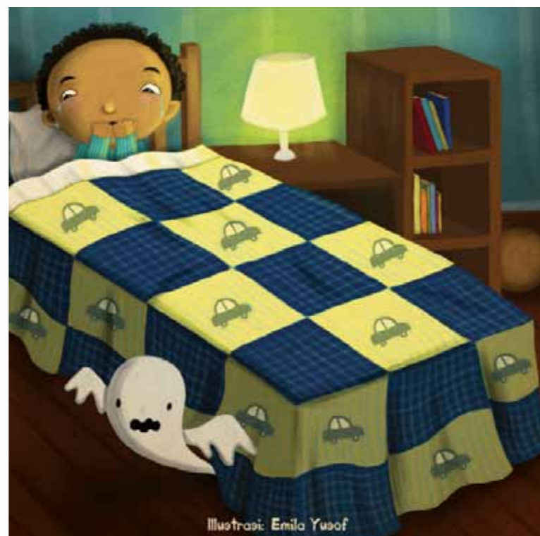
Illustrasi: Emila Yusof